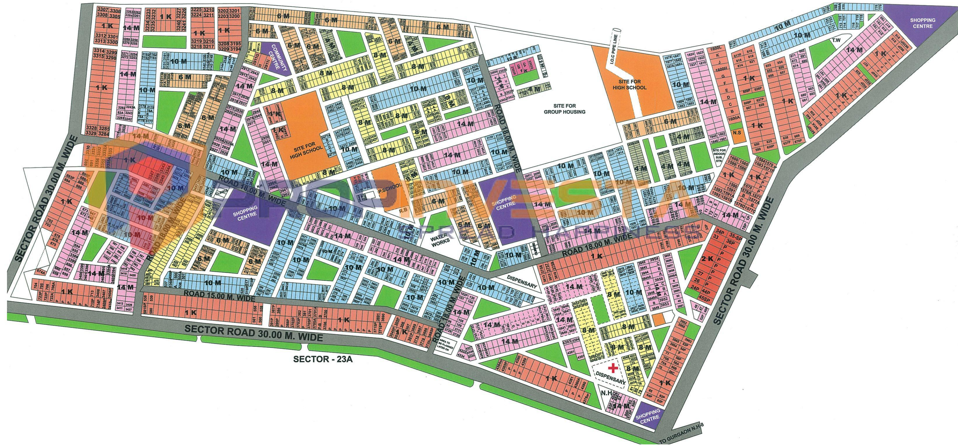
SECTOR - 23A